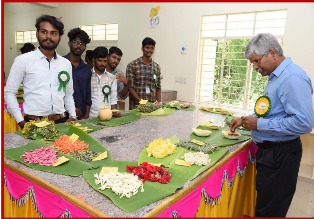
Plants in Generating Livelihood – Exhibit visit by students