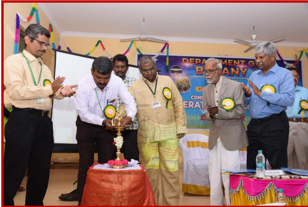
Lighting the Kutthuvilakku