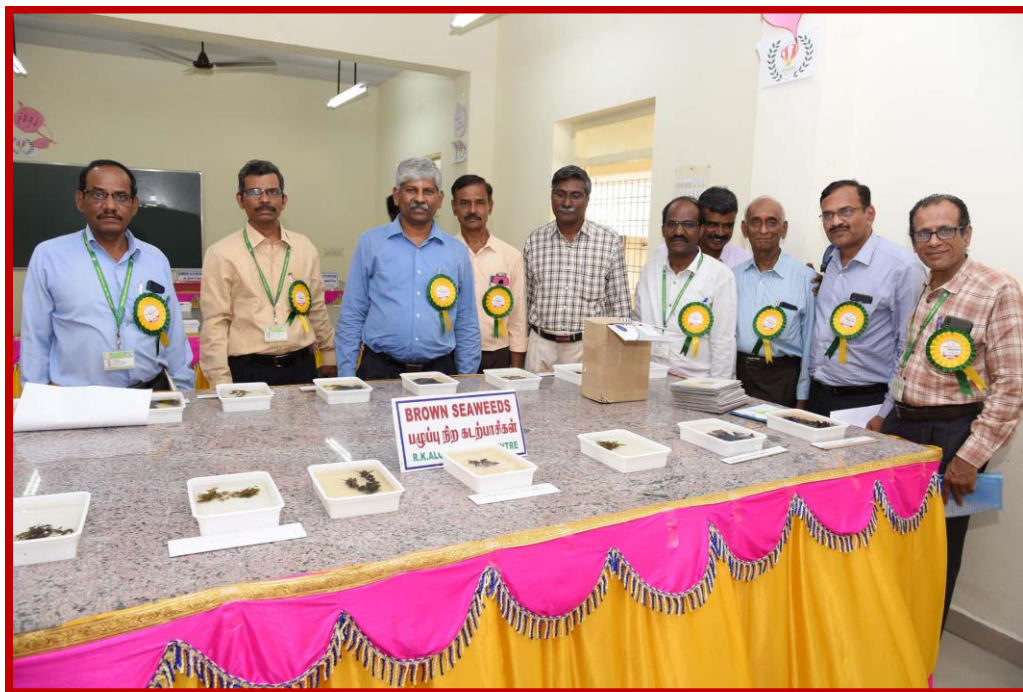
Display of Sea Weeds – Visit by Faculty Members