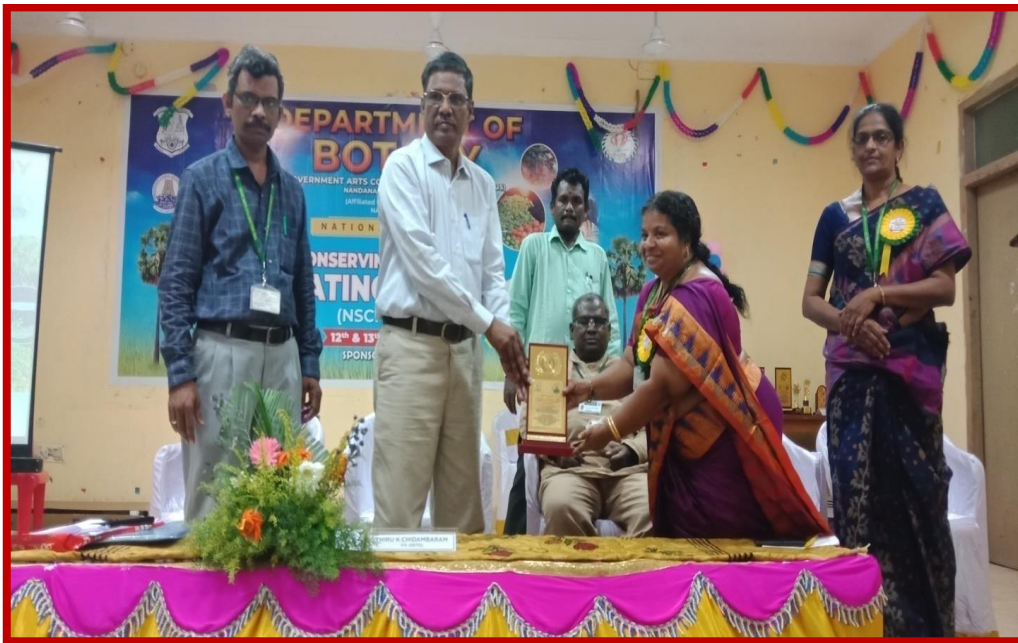
Presenting Memento to Thiru K. Chidambaram IFS(Retd.) Formerly Principal Chief Conservator of Forests, Government of Tamil Nadu