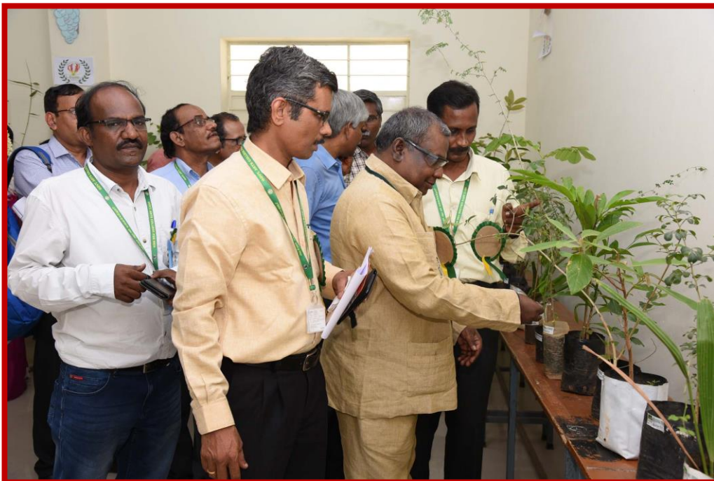
Visit to Medicinal plant Exhibition by Faculty members