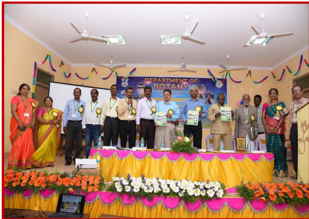
Release of Abstracts – National Seminar on Conserving Plants for Generating Livelihoods(NSCPGL 2020)