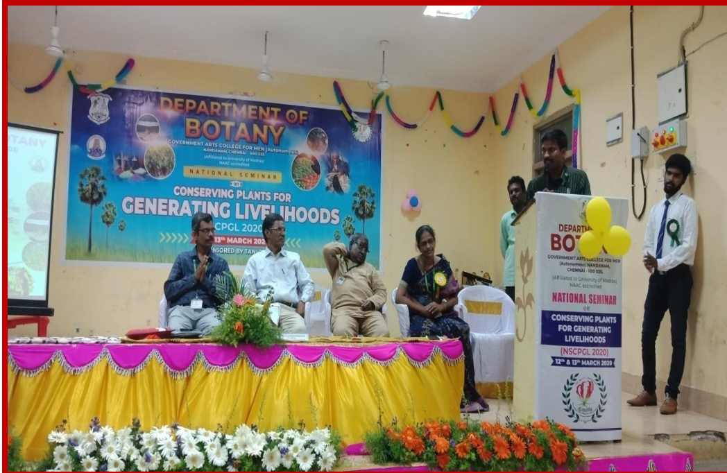
Feedback from Participants about the Seminar – NSCPGL 2020