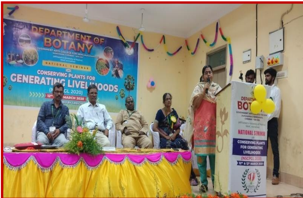
Feedback from Participants about the Seminar – NSCPGL 2020